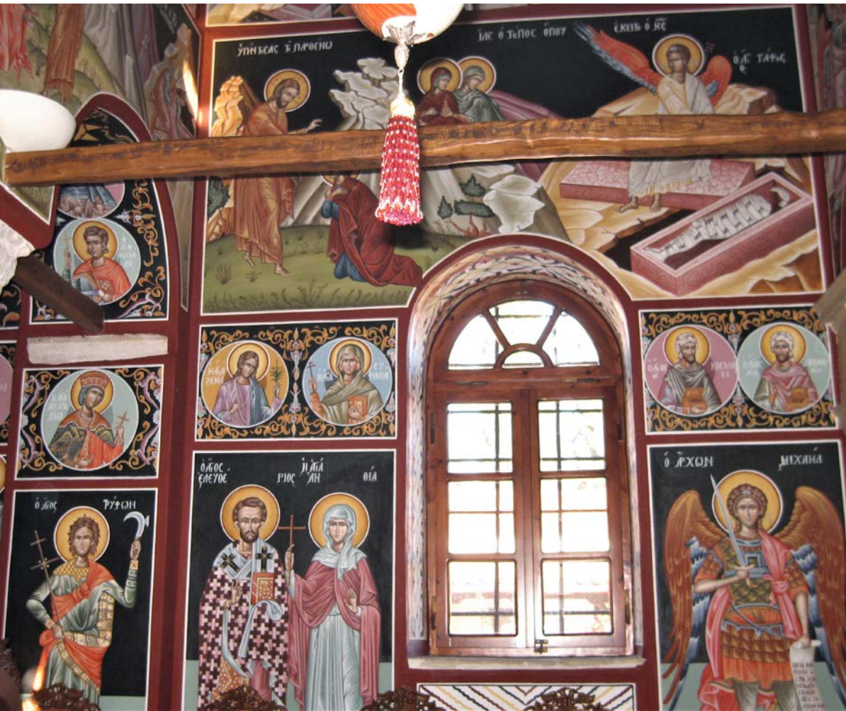
● Caption for page 16 Left: beautiful frescoes adorned the interior of the St John Theologos monastery ● Below: E-type and XK head back out onto the open road